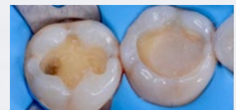
Caries removed and large Class I cavities prepared