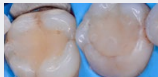
First and second lower molars with defective composite restorations

DR. JOSÉ CEDILLO Fellow and Diplomat Of The World Congress of Minimally Invasive Dentistry - Valencia