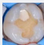
Application of calcium hydroxide to protect the deepest area of one cavity, followed by application of Stela Primer